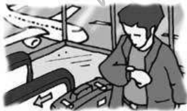
1. she / miss / plane