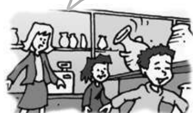
6. you / break / vase