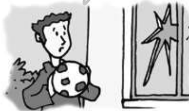
2. parents / be / angry