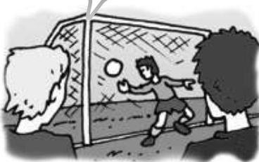
4. the goalkeeper / not catch / ball