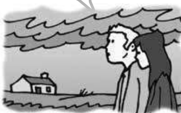
5. it / rain