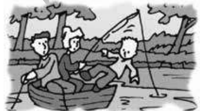
3. Luke / fall / lake